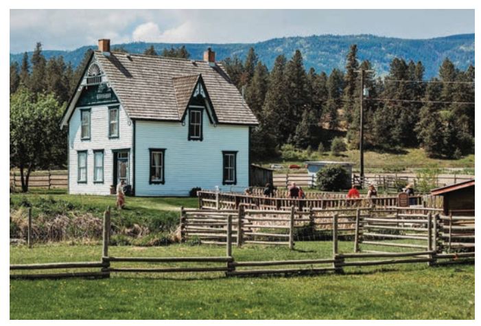
Historic O'Keefe Ranch.

You'll walk over several wooden bridges as you take in the stunning canyon with its sheer cliff walls towering overhead. This is a chance to enjoy nature lover's dream without having to do anything too extreme!