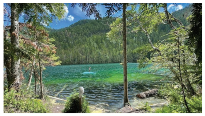
Echo Lake Provincial Park.

With its beautiful clear turquoise water and excellent fishing, it's a perfect destination for anyone who's into kayaking, paddling or canoeing.