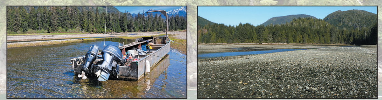
Active Shellfish Company: Nootka Sound Shellfish Ltd currently operates three oyster and clam tenures in the Nootka Sound region. This offering is a share sale for the purchase of the company. The assets include the three shellfish tenures, all stock, and a 29ft skiff for transport. Excellent business opportunity to work on the west coast of Vancouver Island. $299,900