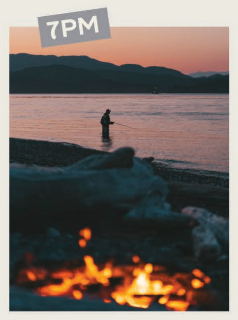
Share your stories of the wild

VISIT: CAMPBELLRIVER.TRAVEL Or call 1.877.286.5705