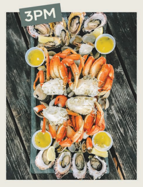
Indulge in local cuisine