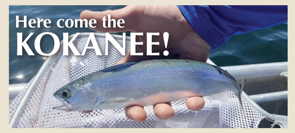
Kokanee caught at Beavertail Lake, near Campbell River, one of two Vancouver Island lakes now stocked with the fish typically only found on the mainland.

Winston says the biggest challenge he's had to overcome since moving to Kelowna is learning to be brave when walking on Manteo resort's new floating docks. He loves the treats and the social time associated with his job and is happiest when making guests feel comfortable.