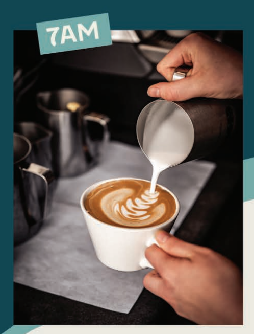
Start your day in comfort

Find your perfect itinerary and get inspired to plan your stay, from where to grab your morning coffee to the best places to embrace the outdoors and experience our community culture.