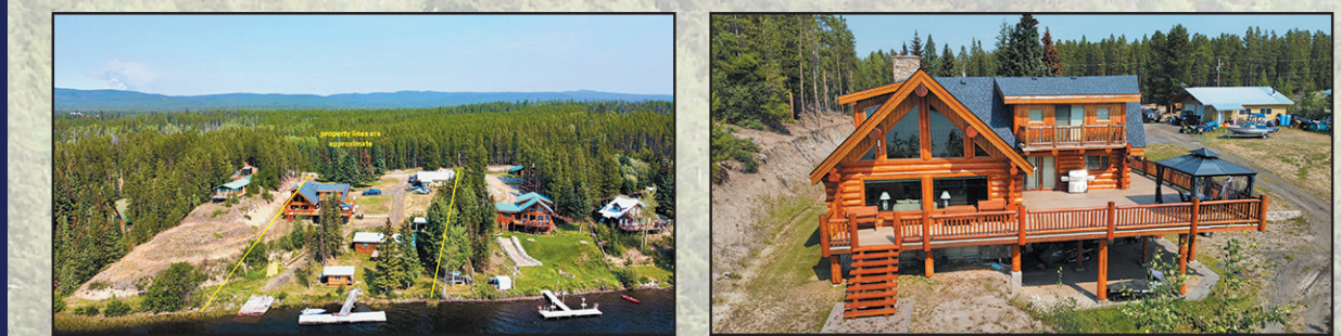
Nimpo Lake Log Home: Attractive 4560sqft log home with amazing views on 1.47 acres. The home features excellent finishing, a gourmet kitchen and a large lakeside deck. In addition the property has a second lakefront residence, a large workshop, a dock and a floatplane ramp. Nimpo Lake serves as a major jump-off point for many wilderness activities in this Chilcotin region. $1,698,000