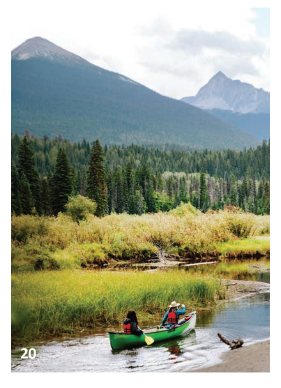
ON THE COVER Paddling in Terrace.