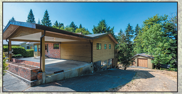
Rare Campbell River Property: Half acre in town, 4560sqft home on three levels and a large, two-story workshop/ garage. Lower back yard with walkout access from the home, and undeveloped natural space behind. Built by a local developer in the 80s for his personal property, the home and shop are constructed to the highest standards of the time. $974,900

Bramham Island Oceanfront Acreage: South-central BC coast region. 140 acres fronting Slingsby Channel, diverse topography and features, approx. 6120ft of oceanfront. Complement of old growth forest, frontage on 3 lakes, approx. 6000 – 8000 cubic metres of merchantable timber. Surrounded by Crown Land, in a spectacular region with endless recreation opportunities. $2,450,000